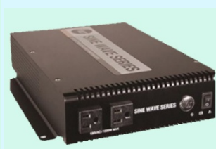
DC ~ AC Inverter