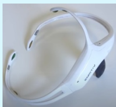
The head piece